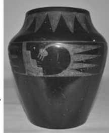
Blackware Vase by Maria Martinez

Continue to challenge your notions of Native American art at the Mitchell Museum's exhibit: Another View of American Indian Fine Art , opening publically on March 16th with a curator's tour of the exhibit at 2:00 PM. Museum members can join us on March 14th from 6:00 - 8:00 PM for a Members' Only Preview Party as we explore native art by focusing on new artists and artwork. New pieces by such notable artists as Woody Crumbo and Maria Martinez will delight and dare the visitor to rethink their conceptions of what Native art is.