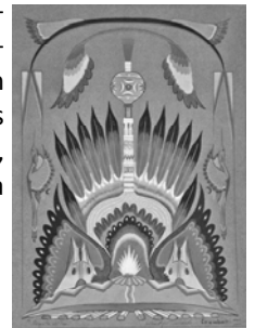
"Peyote Altar" by Woody Crumbo

Woody Crumbo: Crumbo's art has been exhibited in many museums throughout the United States and internationally. He is known for working in oil and egg tempera, as well as in watercolor, sculpture, stained glass, silkscreen, and etching. A member of the Pottawatomie Nation, Crumbo explored the traditions and ceremonies of his own tribe as well as those of the Creek, Sioux, and Kiowa nations.